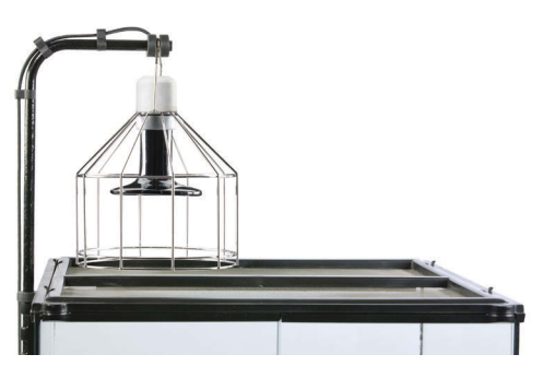
The Ceramic Heater is to be used only with the specially designed Exo Terra Wire Light.