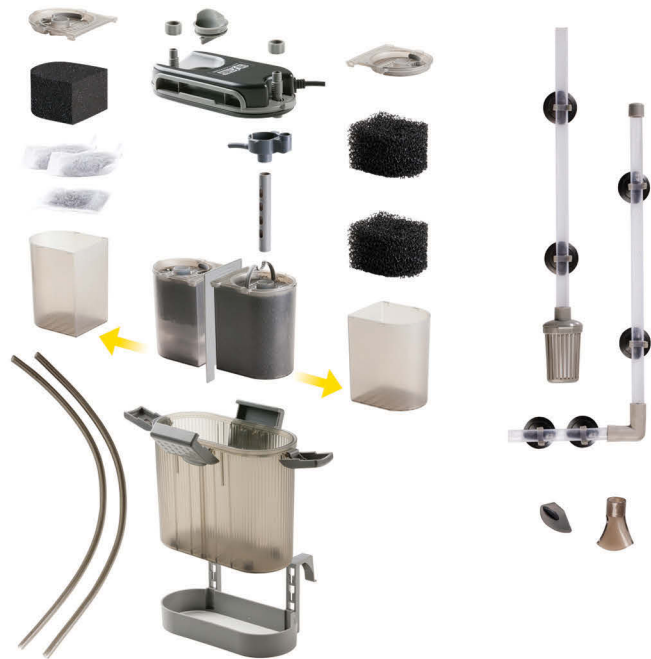
PT3630 External Turtle Filter

Only requires every 1-2 month maintenance intervals for turtle terrariums and 2-4 month maintenance intervals for other aquatic habitats. Includes the following filtration media: fine foam cartridge, coarse foam cartridge, 1 odor reducing pad and dual carbon pads. The odor reducing pad and dual carbon pad combination ensures maximum ammonia absorbing capabilities, beneficial in turtle tanks, paludariums or aquatic terrariums with high biological load.