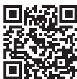
PT2062 Wire Light Large